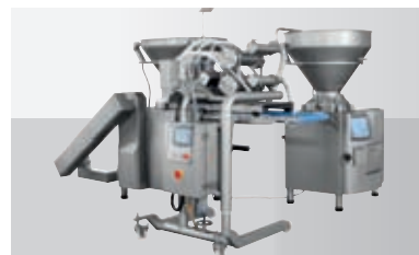
Automated co-extrusion and forming with Koex MFD system