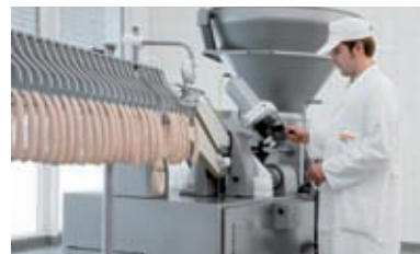
Sausage automation with AL systems