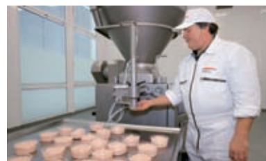
Automated dosing into containers