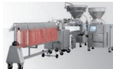
Continuous sausage production with the ConPro 200 system